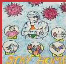
Shivam VII Newton