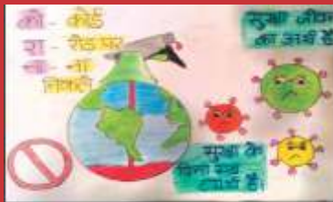
Arnav VI Einstein