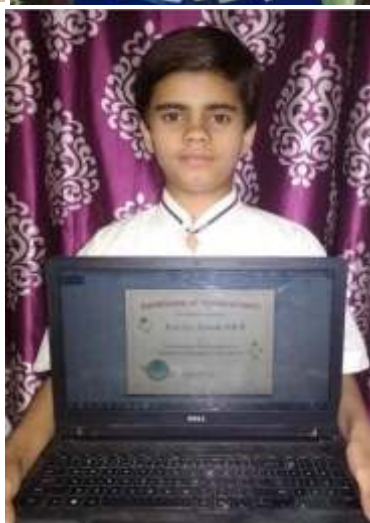
English Poem Recitation Competition

To polish the poetic skills of the upcoming poets, an Intra-section Online e-Poem Recitation Competition based on the theme 'COVID 19' was held on 09 April 2020 for the students of classes VI - VIII. All the participants tried their best to win the hearts of viewers with their melodious poems. The winners were awarded e-Certificates. The winners are: