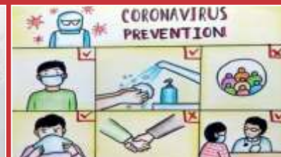
Aditya Antil VI Einstein