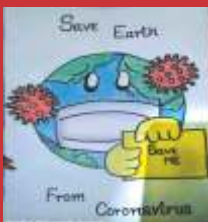
Kartik VI Einstein