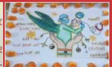
Anshika VI Einstein